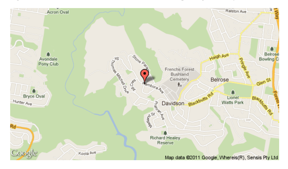
Figure 2 - From Forest Way to Blackbutts Road